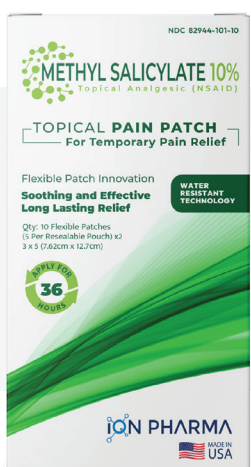
Methyl Salicylate 10%

NDC: 82944-200-02 | Size: 76.5g Bottle | Ingredient: Lidocaine 4%