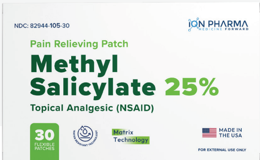
Methyl Salicylate 25%

NDC: 82944-101-10 | Size: 10 Count Box | Ingredient: Methyl Salicylate 10%