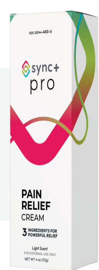
Sync+™ PRO Cream

NDC: 82944- 105 -30 | Size: 30 Count Box | Ingredient: Methyl Salicylate 25%